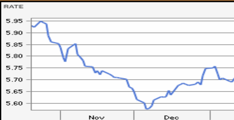
3 Month Trend for the National Average Rate for 30 Year Fixed Loans Priced With 1 Discount Point